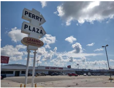
Commercial Corridor and Commercial Facade Improvements