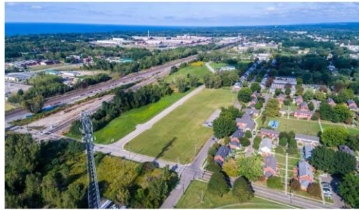
Savocchio Opportunity Park- Grow Erie