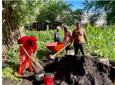
90 home gardens between Downing and June, north of Buffalo Road