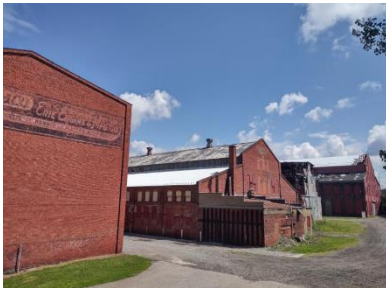
50% of the Neighborhood Industrial/ Manufacturing use