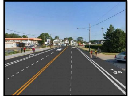
Buffalo Road Rendering (TranSystems Report 2020)