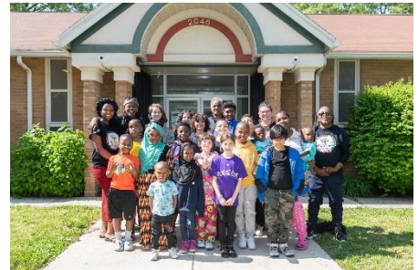
45% of residents in the neighborhood are under the age of 18