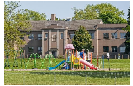
Burton School Redevelopment