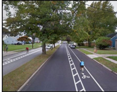
Fairmount Parkway Rendering (TranSystems Report 2020)